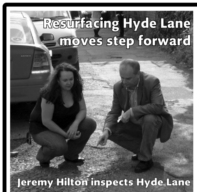
Resurfacing Hyde Lane moves step forward